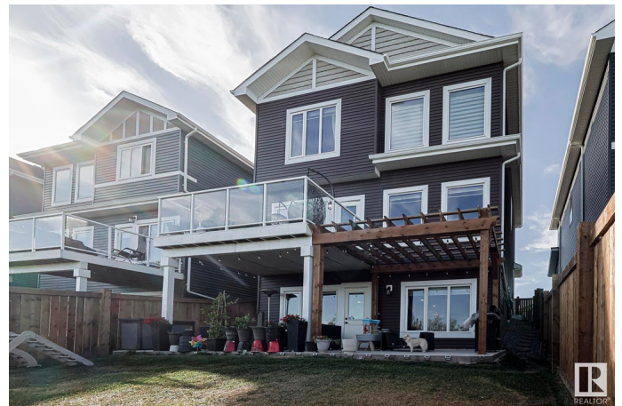
880 Ebbers Cres NW, Edmonton, AB