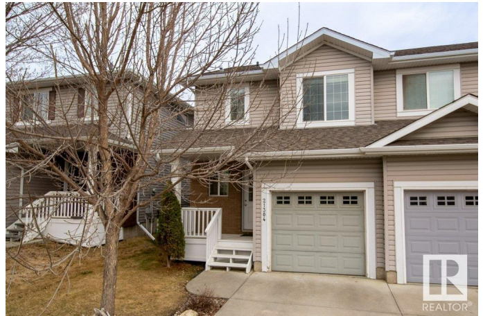
21304 45A Ave NW, Edmonton, AB

No condo fees! Excellent and quiet location in a crescent in The Hamptons. 2 storey Half duplex over 1,229 sf plus a full basement. Big private fenced yard with deck and plenty of sunshine. Attached garage with front drive pad. Hard wood and tiled floors. Huge kitchen with plenty of cupboards and a raised breakfast bar. Spacious Dining Room with patio doors overlooking a sizable deck. Master bedroom with 3 piece ensuite and linen shelving. Good sized extra bedrooms. So close to Granville Costco, Kim Hung Bilingual School and other programs. Perfect for young families and professionals. Priced to Sell!